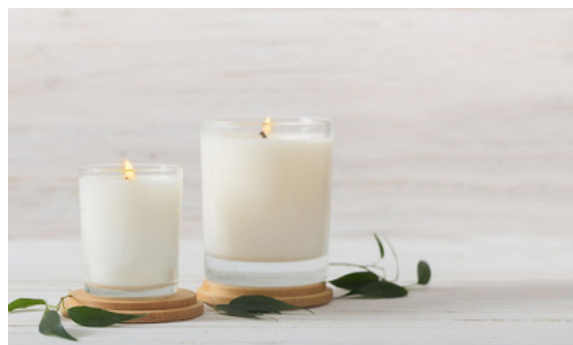
Handmade Perfume Candles