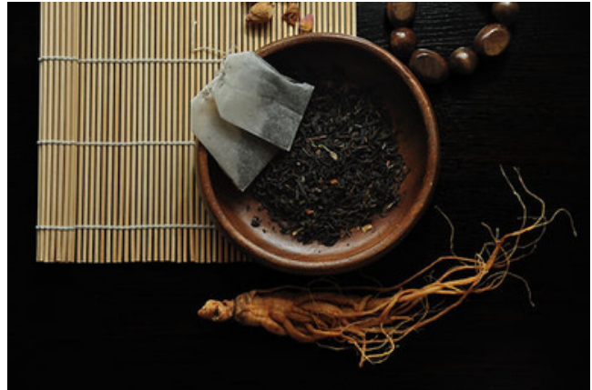
Organic Tea Blend